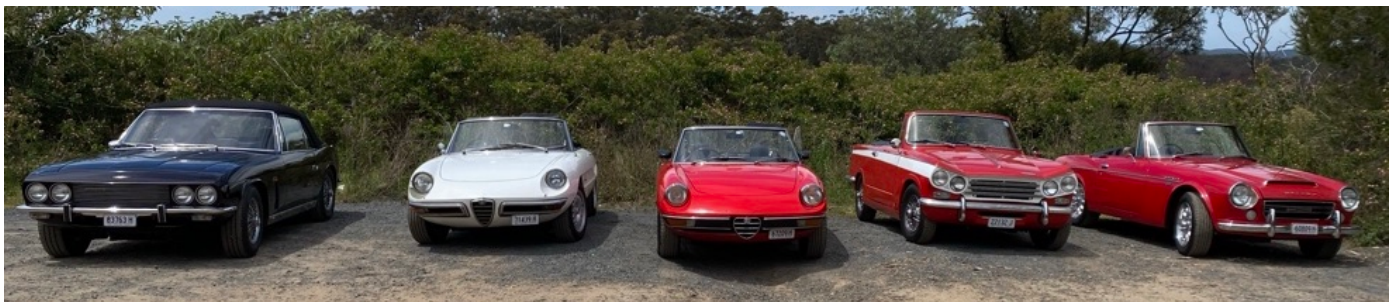
Five 'Pie in the Sky' visitors

The second event was a lunch-run up to 'Pie in the Sky', on Pacific Highway in Cowan. Five Members and cars on that run.